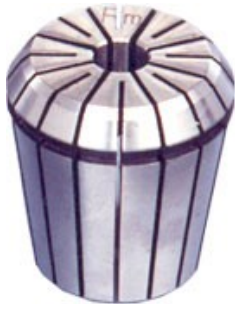
TOOL SUPPORT TYPE ER COLLET